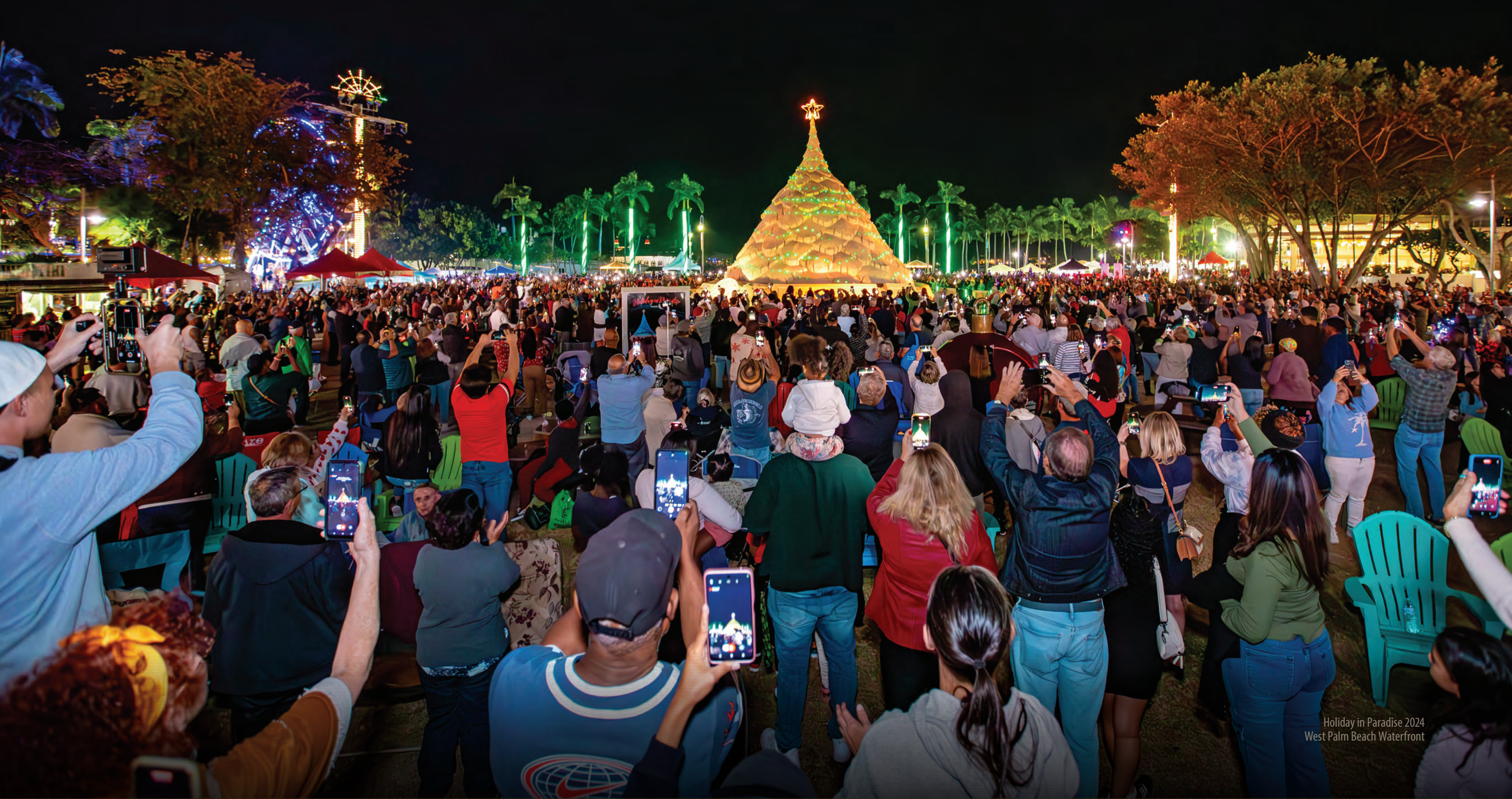
Holiday in Paradise 2024 West Palm Beach Waterfront